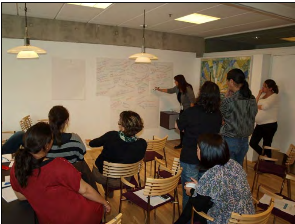
Fig. 3.3 - From a workshop

These conclusions about the nature of the problems became the point of departure for the next phase, which involved a future-creating workshop.