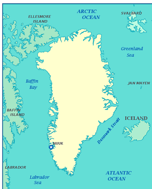
Fig. 3.1 Greenland

For decades, most of the social research about Greenland has been in the form of quantitative studies of social problems. There has been a lack of sociological and transformative knowledge about the conditions and practices of social work.