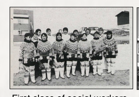
First Greenlandic social reform commission 1980