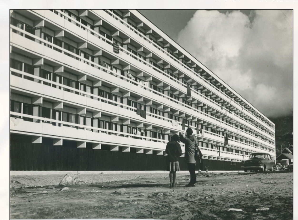
Massive urbanization in the 1970s created the need for Blok P It was the largest residential block in northern Europe at the time