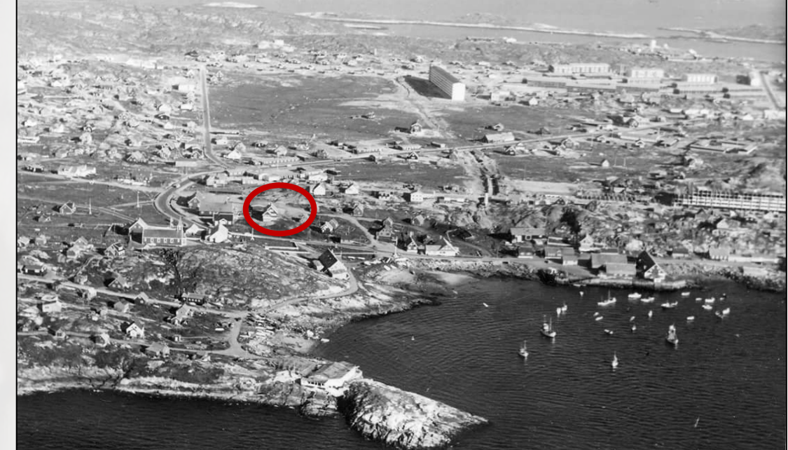
(Photo: The location of the social service office in Nuuk in the 1960s)

During this initial historic archive study we divided the project up starting with the first focus point from 1950-1979 and a second focus point from 1979 to 2018.