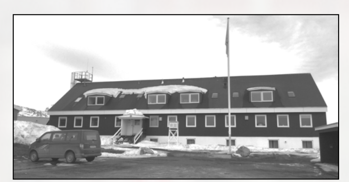
The social & labour administration