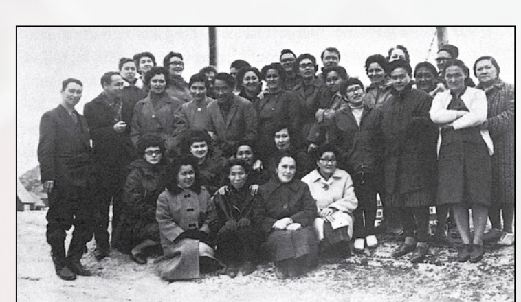
Nuuk in the 1960s First class of social office workers 1966