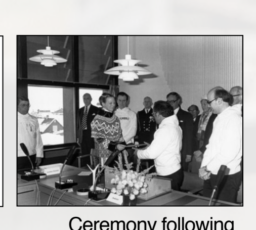
A drastic increase in population & Urbanization demanded modern social systems